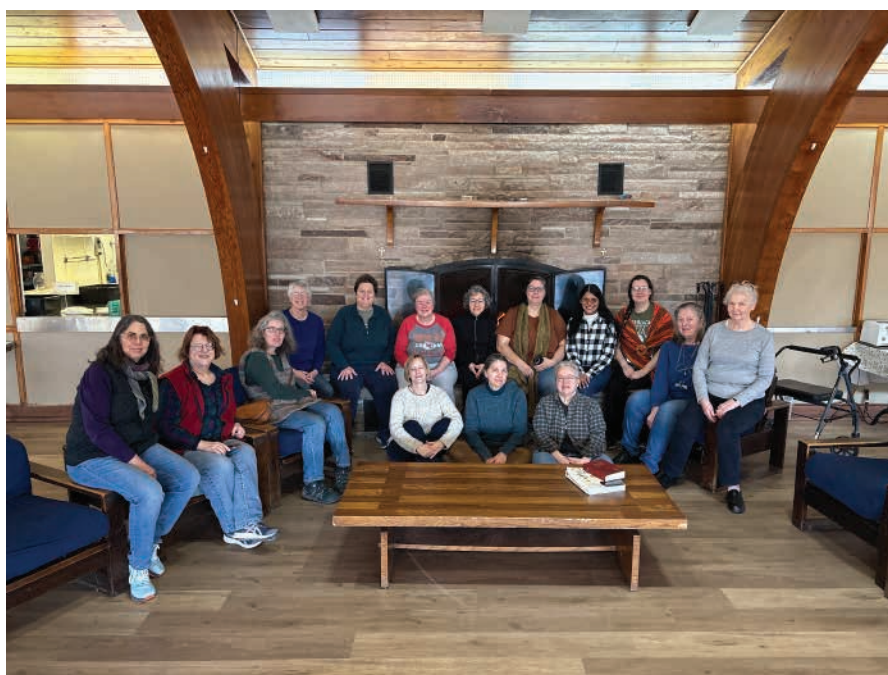
Group photo from the March retreat